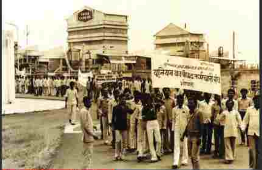
Members of UC Employees Union protesting

The disaster was not an accident. UC had deliberately ignored the essential safety measures in order to cut costs. Much before the Bhopal disaster, there had been incidents of gas leak killing a worker and injuring several.