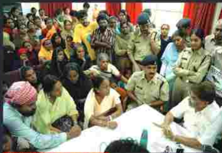
Gas victims with the Gas Relief Minister

Despite the overwhelming evidence pointing to UC as responsible for the disaster, it refused to accept responsibility.