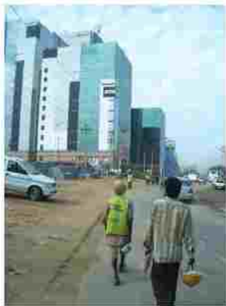
Accidents are common to construction sites. Yet, very often, safety equipment and other precautions are ignored.