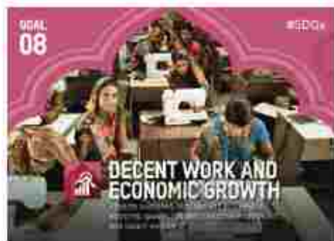
Sustainable Development Goal (SDG)

While the government has a leading role in this respect, people can exert pressure so that both private companies and the government act in the interests of society. Environment, as we saw, is one example where people have pushed a public cause and the courts have upheld the right to healthy environment as intrinsic to the Right to Life. In this chapter, we have argued that people now must demand that this facility of healthy environment be extended to all. Likewise, workers' rights (right to work, right to a fair wage and decent work conditions) is an area where the situation is still very unfair. People must demand stronger laws protecting workers' interests so that the Right to Life is achieved for all.