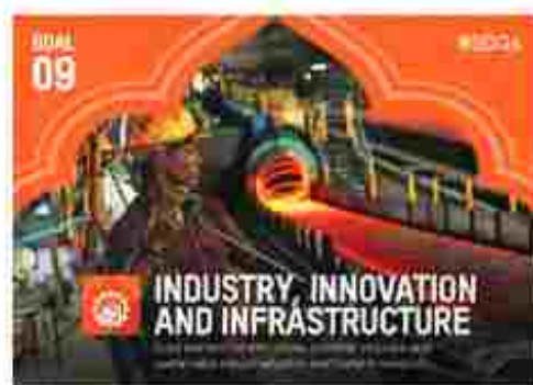
Sustainable Development Goal (SDG)

A 'clean environment is a public facility.' Can you explain this statement?