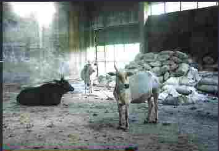
Bags of chemicals lie strewn around the UC plant

UC stopped its operations, but left behind tons of toxic chemicals. These have seeped into the ground, contaminating water. Dow Chemical, the company who now owns the plant, refuses to take responsibility for clean up.