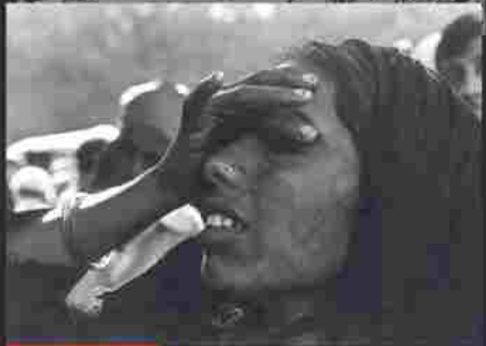
The next morning