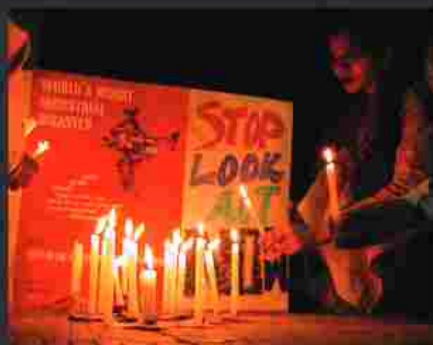
The struggle for justice goes on...

24 years later, people are still fighting for justice: for safe drinking water, for health-care facilities and jobs for the people poisoned by UC. They also demand that Anderson, the UC chairman who faces criminal charges, be prosecuted.