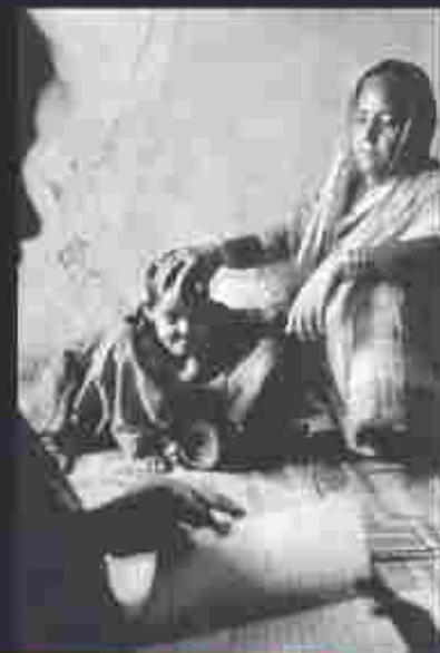
A child severely affected by the gas

Most of those exposed to the poison gas came from poor, working-class families, of which nearly 50,000 people are today too sick to work. Among those who survived, many developed severe respiratory disorders, eye problems and other disorders. Children developed peculiar abnormalities, like the girl in the photo.